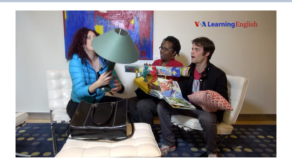
Activity - What's in My Hand?