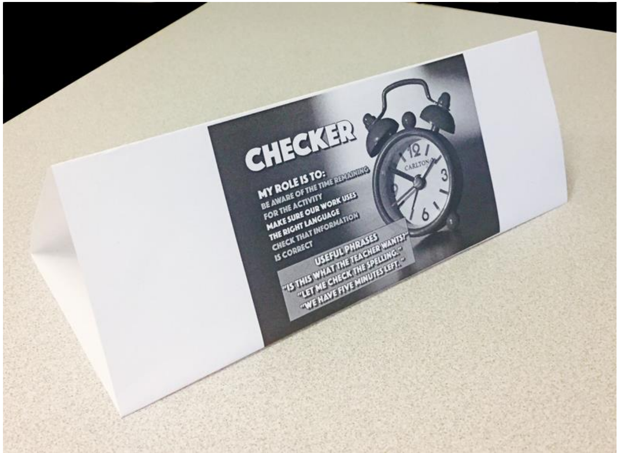
Example of a tent card folded to sit on a table