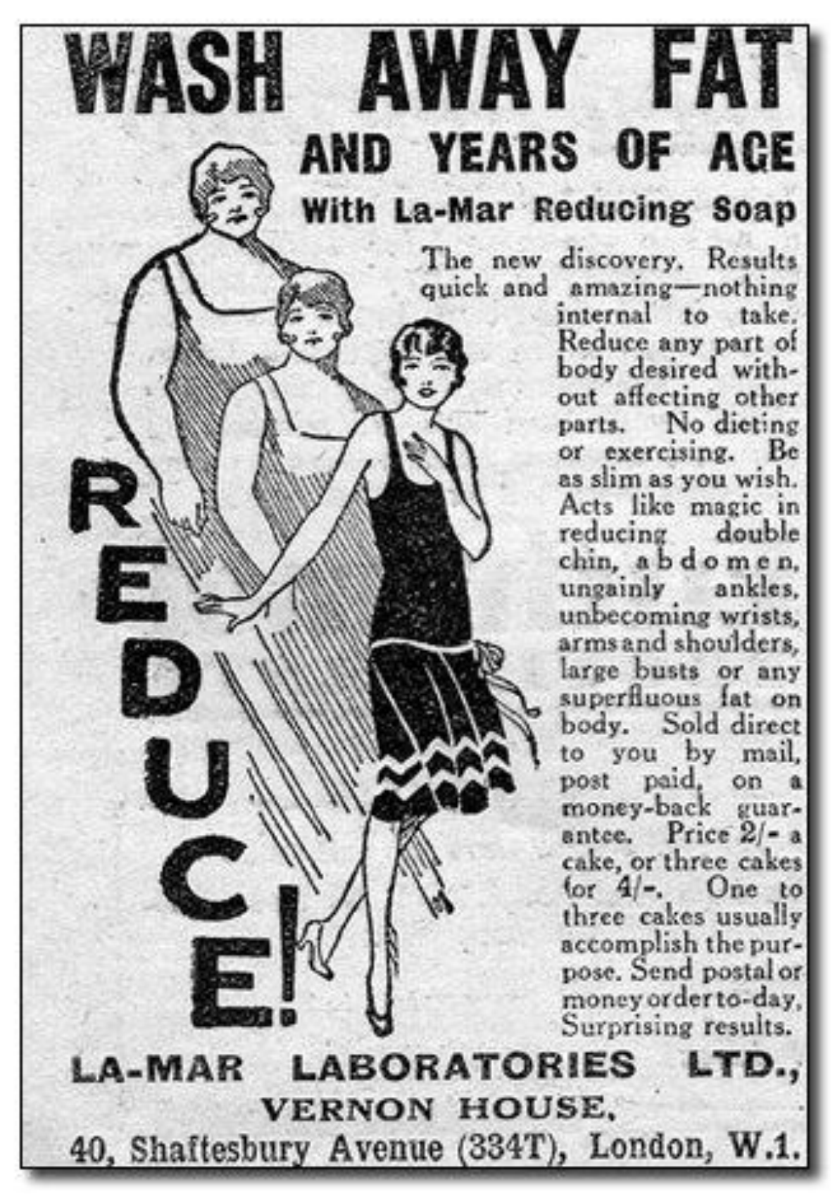
False claim: Soap can remove fat from inside a person's body.