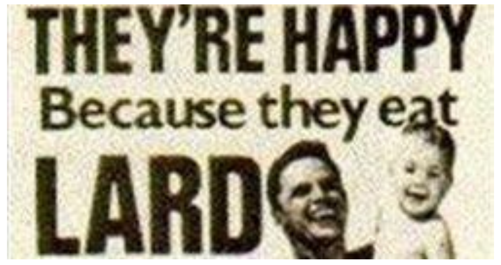
False claim: Animal fat makes people happy