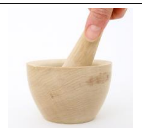
5. What is this tool?