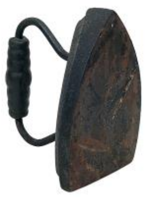
6. Do you have one of these?