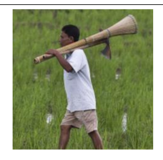
2. What is the man carrying?