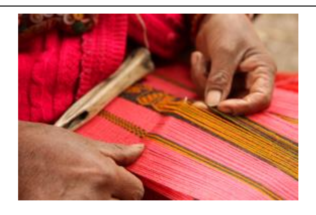
3. What does the woman use to weave?