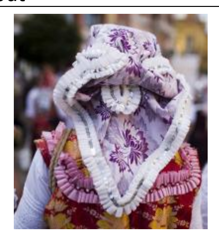
1. What is this woman wearing?