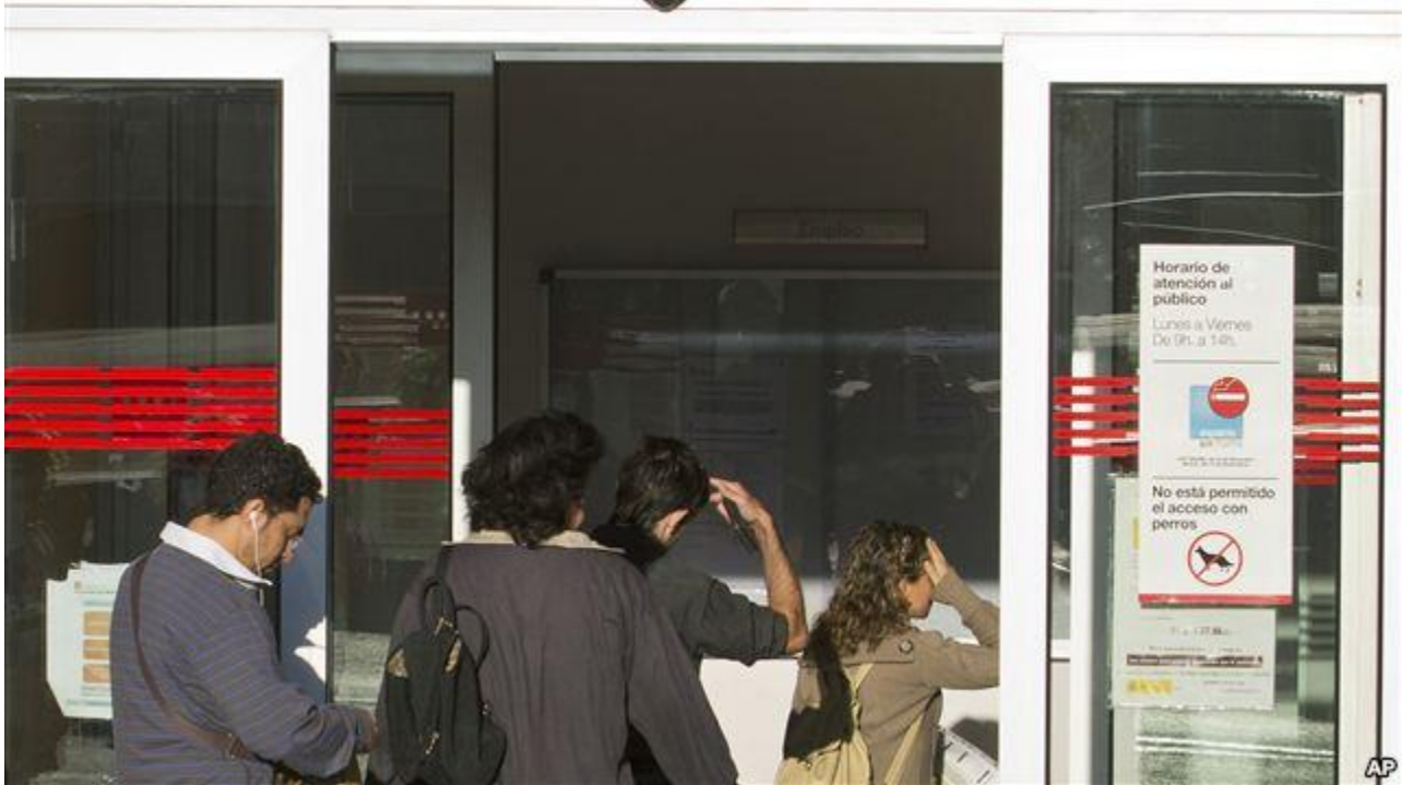
People enter an unemployment registration office in Madrid, September 4, 2012.

From VOA Learning English, this is the Economics Report in Special English.