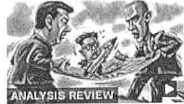
North Korea's mystery unmasked

Printed from: http://www.ft.com/cms/s/0/9e8c4212-7dd7-11e3-95dd-00144feabdc0.html