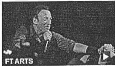
Bruce Springsteen: still got it?