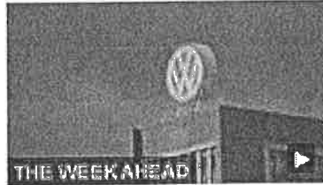
Week Ahead - VW results, US job numbers